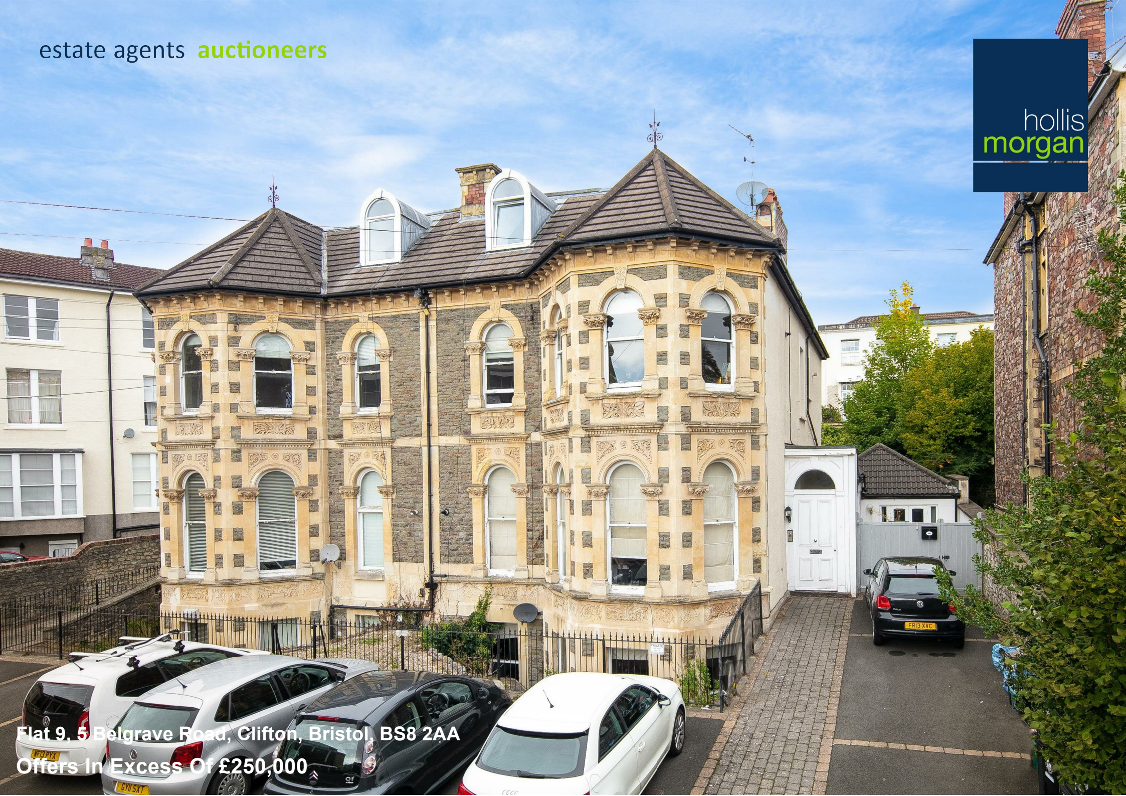
Flat 9, 5 Belgrave Road, Clifton, Bristol, BS8 2AA Offers In Excess Of £250,000